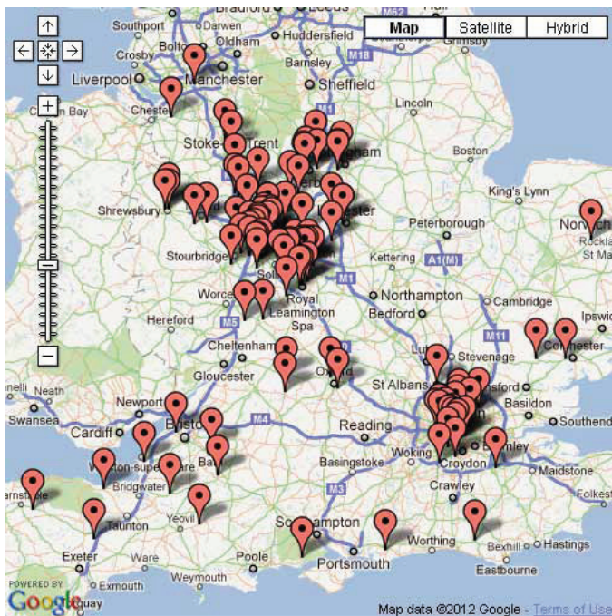
Distribution of reported sightings of allium leaf miner

Last year the pest reached Ryton Gardens for the first time and various staff members reported it on gardens and allotments in the Coventry and Leamington area. We decided to carry out a survey, which went out primarily to Garden Organic members by email, but also to OGA members and others, to see how far it had spread. We received 113 responses or positive sightings of the pest, primarily in the Midlands, spreading east to Coventry and north to Stoke and Nottingham. There was also a cluster in the London area, and scattered reports from Norwich to Devon. Although damage was recorded on all allium crops, leeks were by far the worst affected; garlic seemed to be the least affected. Many were experiencing the pest for the first time and crops had been devastated. One grower wrote: “It was amazing how quick the damage spread – within a few days a healthy crop was blasted, and this was true across the seven-acre allotment site.”