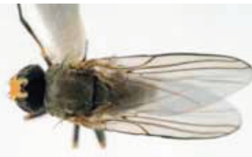
Adult Allium leaf miner fly